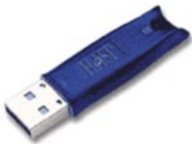
The Hardware Key

This is a picture of the USB hardware key (though your key may differ slightly in appearance).